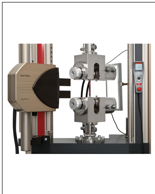
A comprehensive range of accessories is available from ZwickRoell.