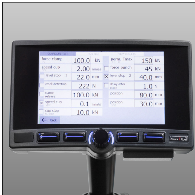
Display for BUP 100 / 200 (1048582)